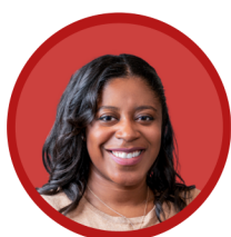
CAPRA FELLOWS Vice-President Theatre '11