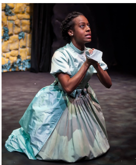
As Melibea in the 2016 New Orleans Shakespeare Festival production of The Illusion