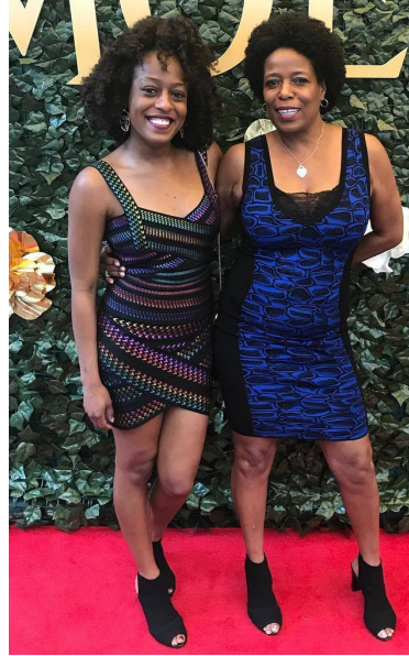
With her mother at a red carpet event