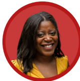
CAPRA FELLOWS Vice-Chair Theatre '11